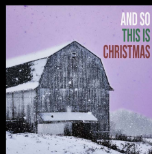
AND SO THIS IS CHRISTMAS (EP)