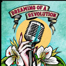
DREAMING OF A REVOLUTION (SINGLE)